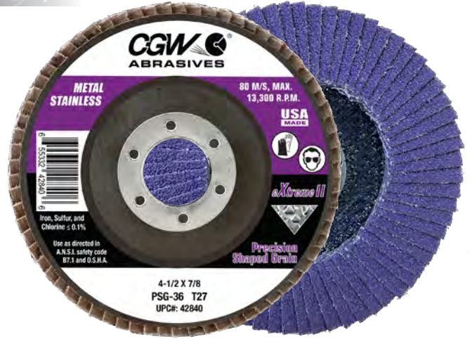
Precision Shaped Grain